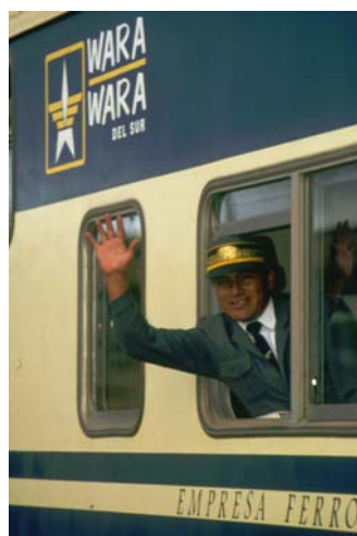
[El Expreso Wara Wara]

Another passenger train service out of SCZ run by Ferrovía Oriental is the line to the Argentine border at Yacuiba. There is a very comfortable ferrobus service for approximately $15 USD that makes the trip in about 9 hours. Once in Argentina, you can get bus service to nearby cities where you can then connect by bus or train to interior destinations.