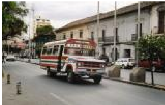
[Microbus – Cochabamba]

The Jorge Wilsterman Airport in Cochabamba is located at the edge of the city center. In 2004 CBBA built a new airport terminal. It is an impressive modern structure that has all the amenities. For less than a $2 USD, a ten-minute taxi ride, you can get from the airport to anywhere within the city center.