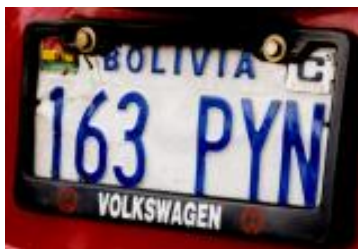
[Bolivian License Plate]

If you rent a vehicle, we also recommend that you consider the services of a driver ( chofer ). Check out the section entitled Chofer Services in the following section of this directory. Also be advised, the rental agencies generally do not allow you to drop off a car in another city. Parking can be a problem. You should not leave your vehicle unattended on the street at night. Hotels can usually accommodate parking.