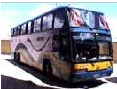
[Transporte Internacional Litoral]

The bus terminal in La Paz, also called the Terminal Terrestre, is located in Plaza Antofagasta. A more exact address is Avenida Perú between Avenida Móntes and Avenida Armentia.